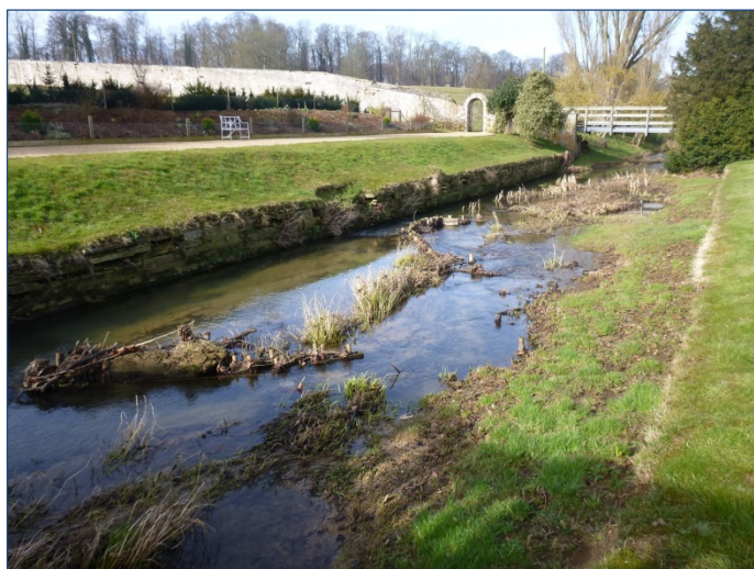
The River Witham through Easton Walled Garden - Before