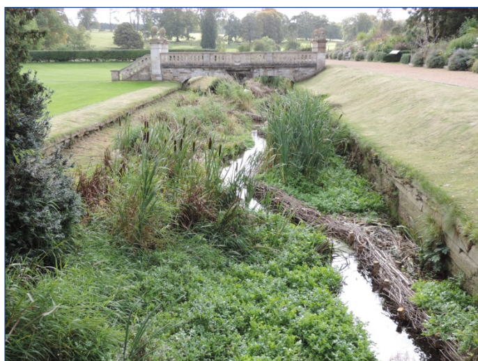
The River Witham though Easton Walled Garden - After