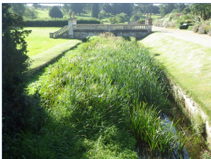
The River Witham though Easton Walled Garden - Before