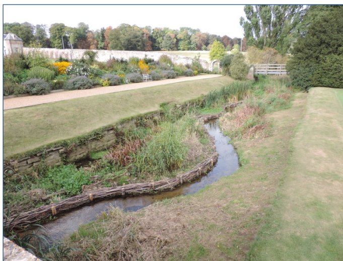
The River Witham through Easton Walled Garden - After