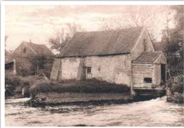
Harrowby Mill Grantham, circa 1900

The earliest mention of a mill in Harrowby is in the Domesday Book of 1086, when the whole manor was valued at ten shillings. The mill was demolished circa 1967.